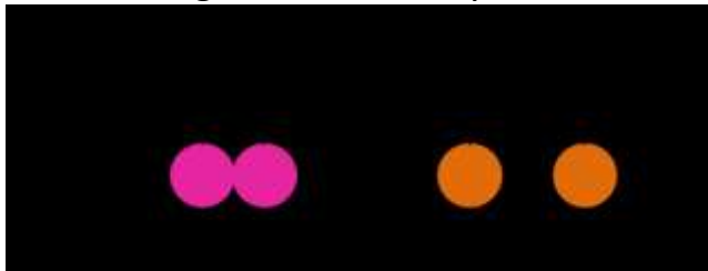
Thread with Charged and Uncharged Balloons

Ans: When two charged balloons are brought near each other, they repel because like charges, they repel each other. On the other hand, when an uncharged balloon is brought near a charged balloon, they attract each other because unlike charges attract each other.